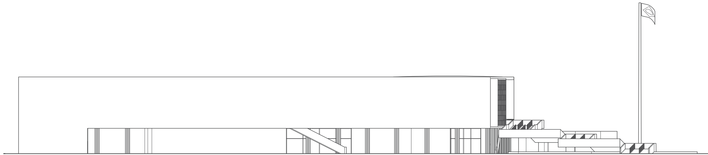
SOUTH ELEVATION SCALE 1/32" = 1'