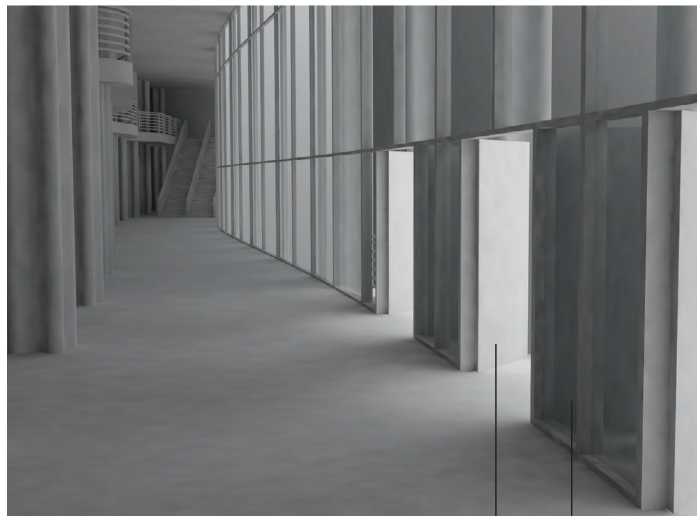
RENDER 3: INTERIOR