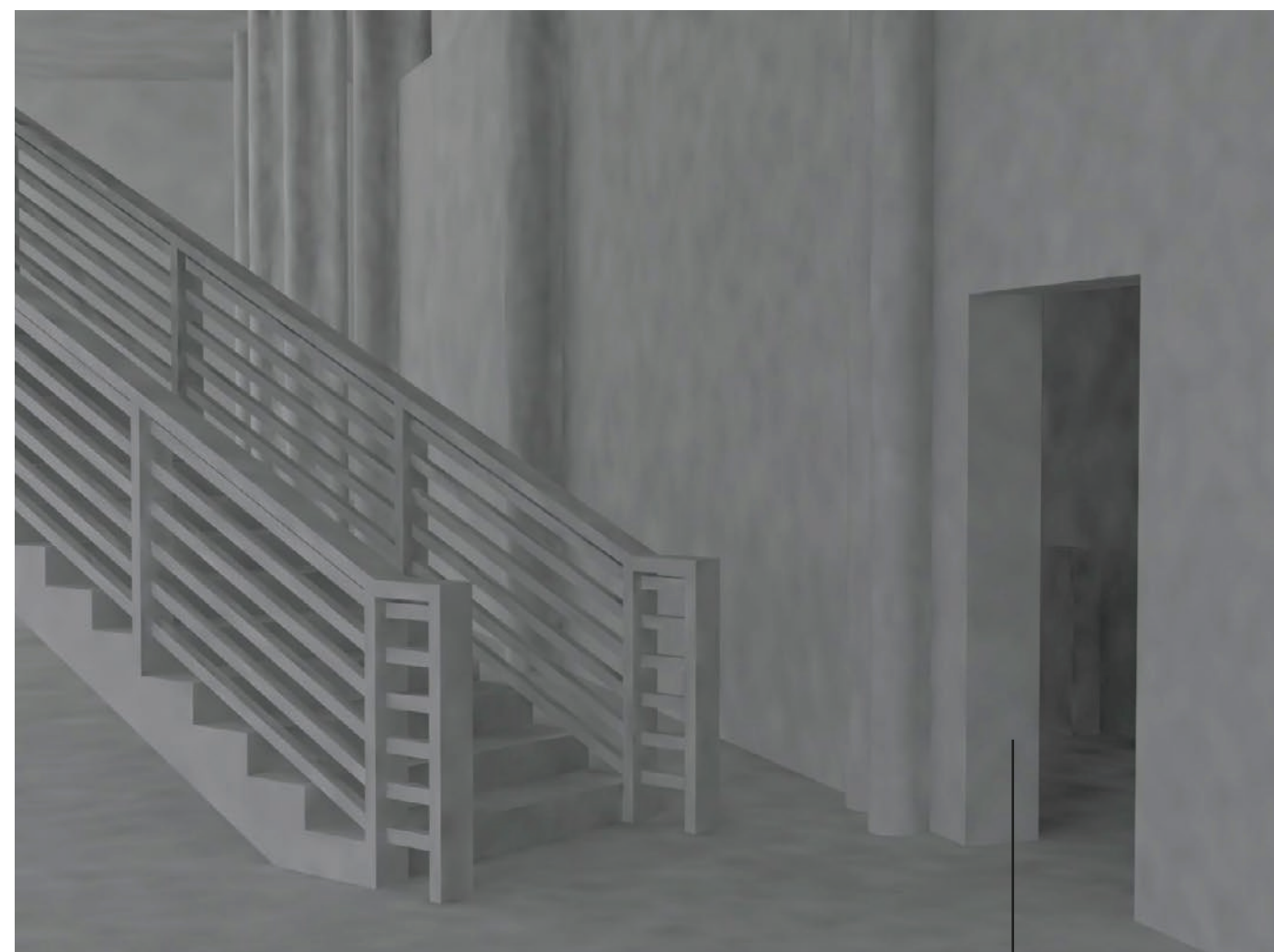
RENDER 4: INTERIOR